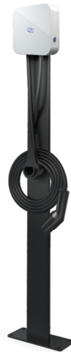
Floor mounting with post