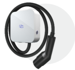
Wall mounting with cable management