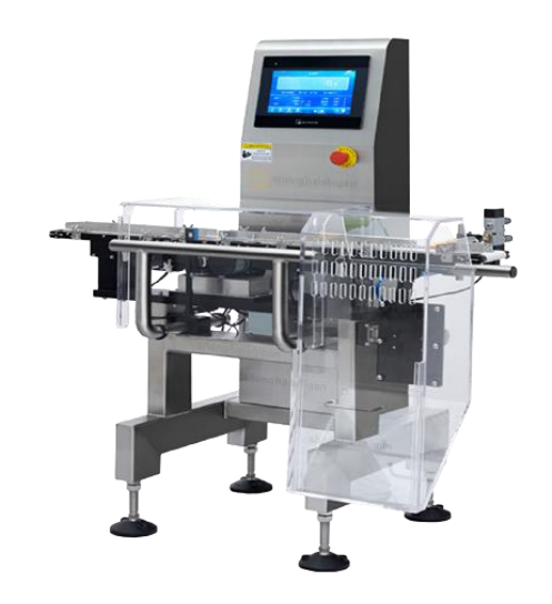
SG-100 Small bag packing checkweigher