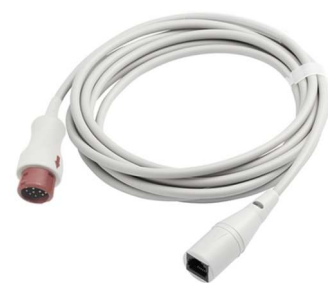
Philips 12P to Abbott