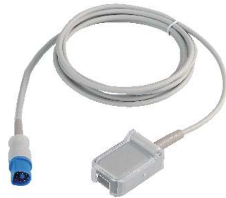
Philips 8P SPO2 extension cable

We have SPO2 extension cables suitable for all kinds of brand monitors, such as Mindray, Philips, GE, etc.