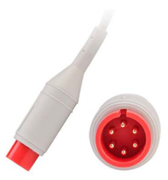
▲ Mindray 6P