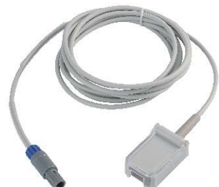
Mindray 6P SPO2 extension cable