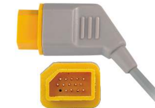
▲ Nihon Kohden 14P