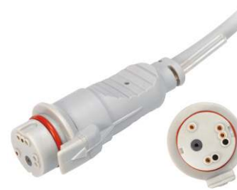
▲ BD connector