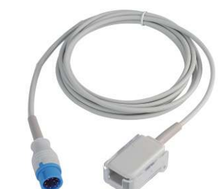
Biolight A Series SPO2 extension cable