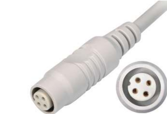
▲ BL connector