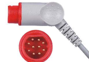
▲ Siemens 10P