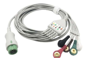
EDAN 12P 5LD Snap AHA ECG cable