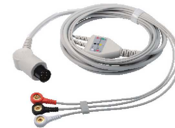
6P 3LD Snap AHA ECG cable