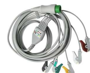
Mindray 12P 5LD Clip ECG cable