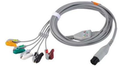
6P 5LD Clip IEC ECG cable