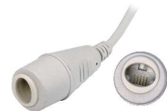
▲ Edwards connector