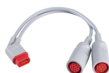
Drager 16P to double Siemens 10P