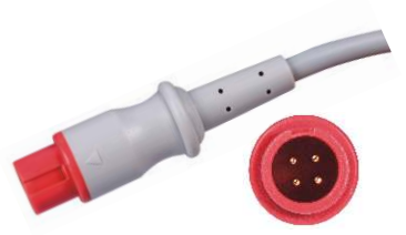
▲ Biolight 4P