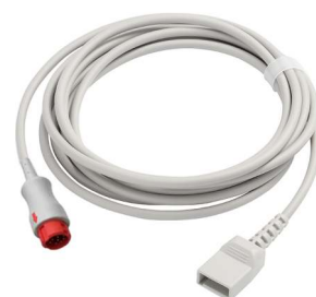
Mindray 12P to Utah