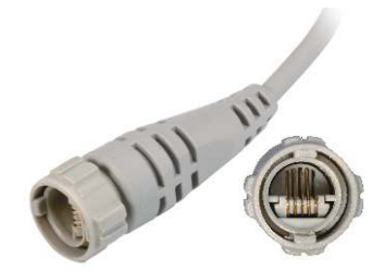
▲ Medex connector