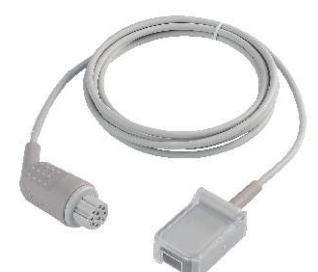
Datex 10 holes SPO2 extension cable