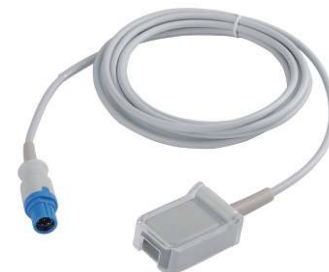
Siemens 7P SPO2 extension cable