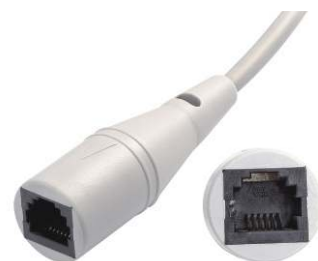
▲ Abbott connector