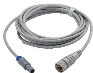
HuaNan 5P to Medex