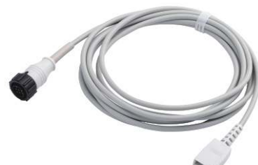
Bard 8P to Utah