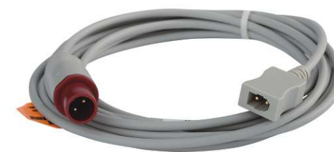
Philips temperature extension cable

We have temperature extension cables suitable for all kinds of brand monitors, such as Mindray, Philips, GE, etc.