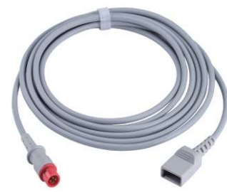
Biolight 4P to Utah