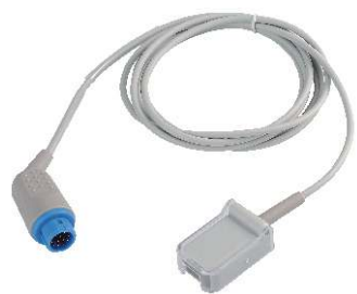
Philips 12P SPO2 extension cable