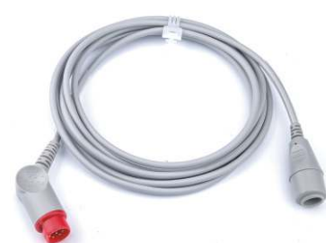
Siemens 10P to Edwards