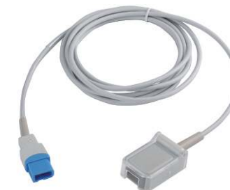
Space 10P SPO2 extension cable