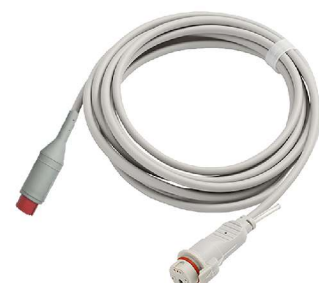
Mindray 6P to BD