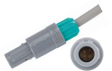
▲ JJ-LEAD 4P