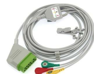
Nihon Kohden 12P 3LD Snap IEC ECG cable