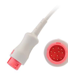
▲ Mindray 12P