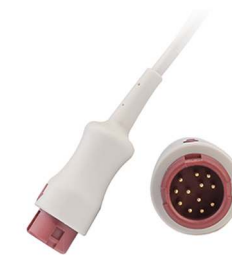
▲ Philips 12P