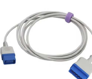
GE 11pin Omeida SPO2 extension cable