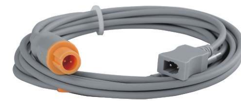
Mindray temperature extension cable