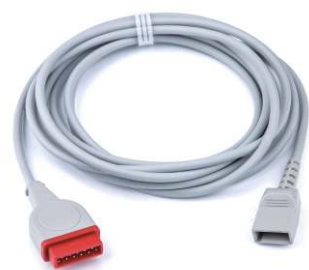
GE 11P to Utah