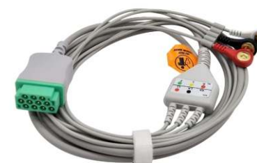
GE 11P 3LD Snap AHA ECG cable