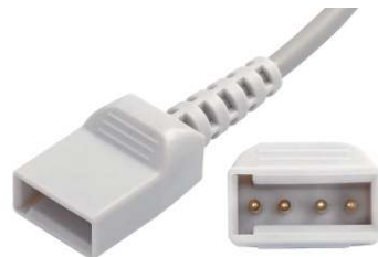
▲ Utah connector