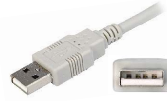
▲ USB connector