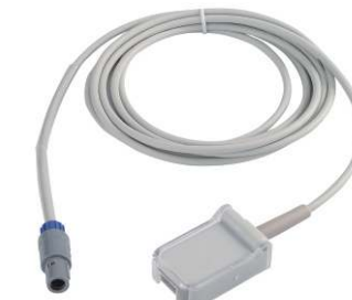
Goldway 5P SPO2 extension cable