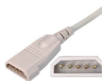
▲ PVB connector