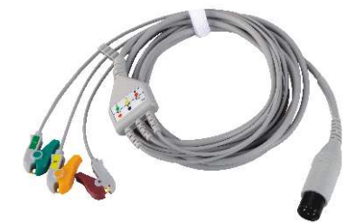
6P 3LD Clip IEC ECG cable