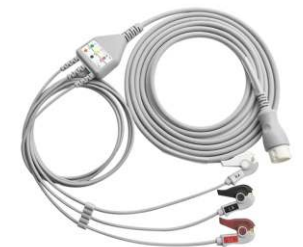
Philips 12P 3LD Clip AHA ECG cable