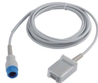
Mindray T Series SPO2 extension cable