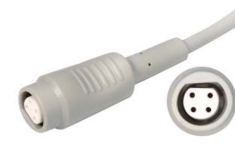
▲ Mindray connector