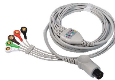
6P 5LD Snap AHA ECG cable