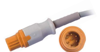
▲ Siemens 7P